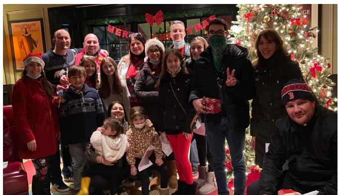
GOYAns and their families caroling at local diners spreading Holiday cheer

of our chapter. We meet on the first Sunday of each month after the liturgy. Join us and I promise you your involvement will be spiritually uplifting. Your active and/or financial support enables the Philoptochos Society to be effective as a contributor to charitable organizations and to assist in fulfilling the needs of our parish. The greater the support, the greater the potential of Philoptochos to fulfill and expand its ministries. We can achieve a lot all together. Talk to anyone of our members on how you can join us. We are mothers, daughters and sisters in Christ and we will be there for you in time of need.