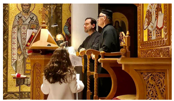
Our chanters lead the hymns during the Divine Liturgy on Christmas Eve

The Logos is proud to relaunch our bi-monthly parish newletter this month with a refreshed layout, and new and improved content. This has been hard work by all involved from members of the committee. We look forward to continue to revive this ministry of the church. We are always looking for feedback as well as content from parishioners and advertisements that help us fund this vital ministry.