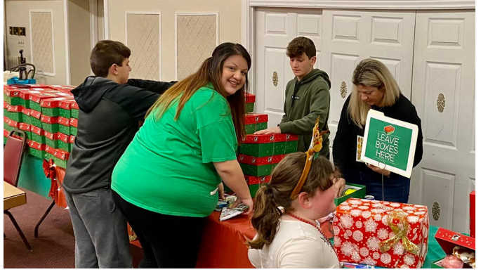
Volunteers pack care packages for children in need during our Operation Christmas Child packing night