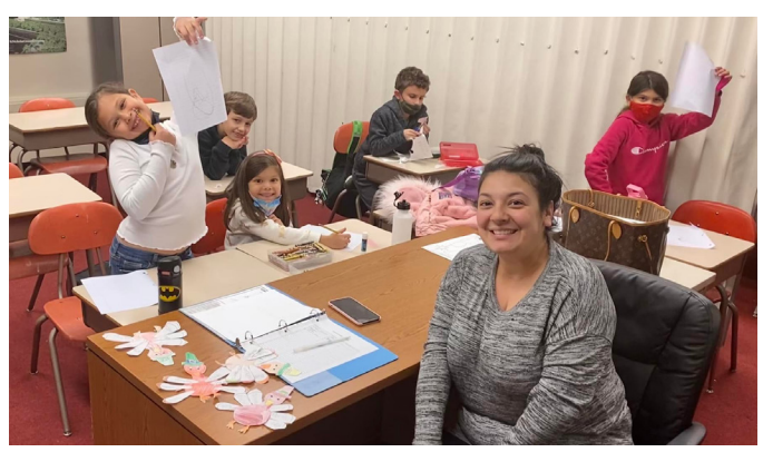
Greek School is back in session! Our students show off their work