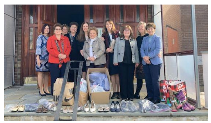
Philoptochos collects shoes and warm clothing for community members in need