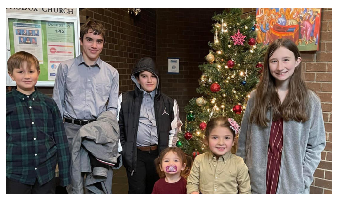
Youth from the Parish decorate our Christmas tree in the narthex